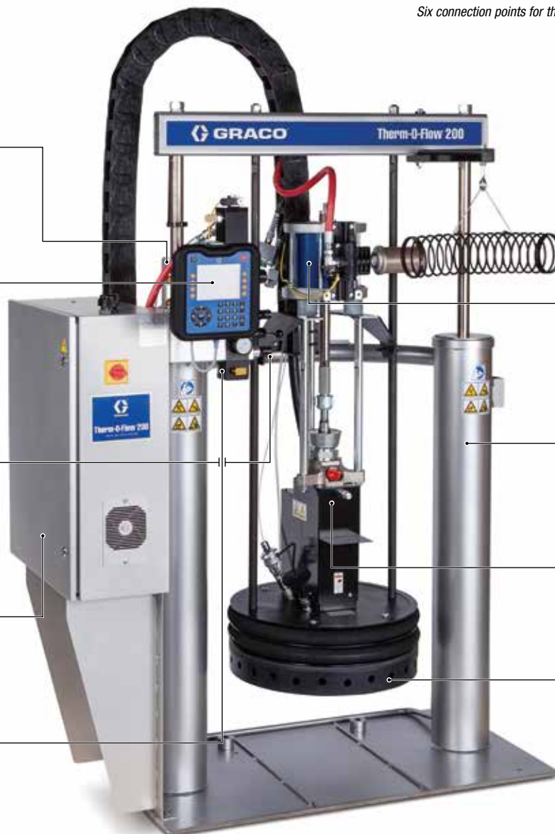
Therm-O-Flow 200 (55 gal)

Easy-to-maneuver casters are sold as a kit for the 5 gallon system