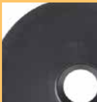
55 gal (200 l)