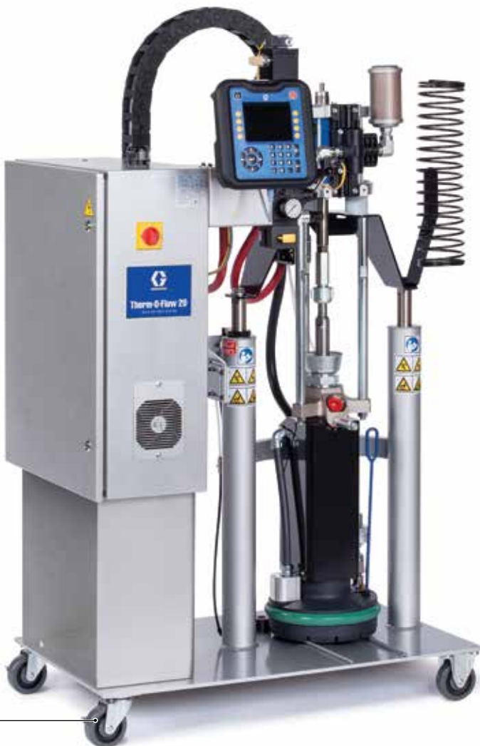
Therm-O-Flow 20 (5 gal)