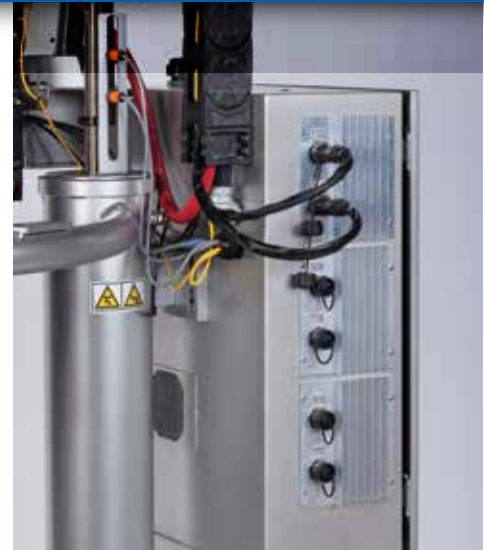
Six connection points for the 12 customer defined heat zones

Graco offers a complete line of Therm-O-Flow bulk hot melt systems and "point of use" melt systems – each can be configured to fit your specific application.